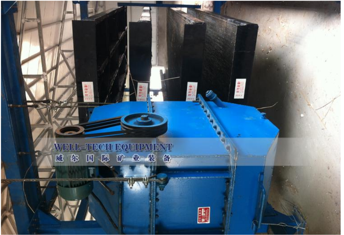
4 layer shaking table transmission