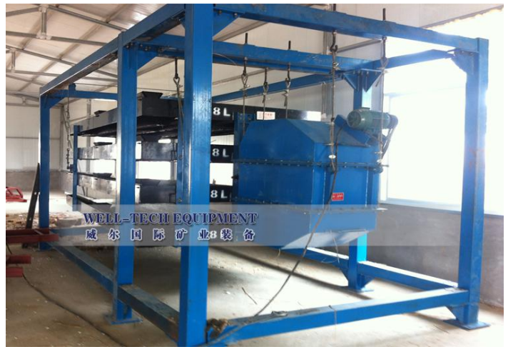
4layer shaking table in Myanmar