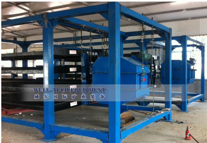
4layer shaking table gold plant in Russia